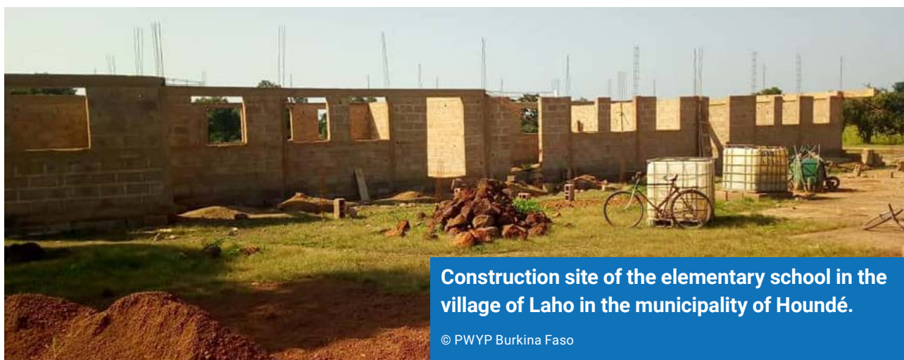
Construction site of the elementary school in the village of Laho in the municipality of Houndé.

Lobbying initially focused on the Network of Parliamentarians for Good Governance in Mining and the Committee on Social Affairs and Sustainable Development – the committee responsible for the bill. In 2014, at a coalition training session for parliamentarians on reforming the 2003 mining code, civil society advocates raised social and environmental issues as part of their advocacy for the 1 per cent campaign. They also sent strong, evidenced messages through the media,