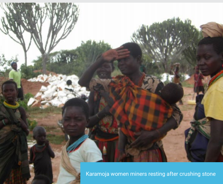
Karamoja women miners resting after crushing stone

scoping study on raising public awareness of gender issues will not ensure that they are mainstreamed into extractives governance, which would require government and extractive industry company awareness and related specifically-designed activities. Toward this end, discrete gender components should be included within the many scoping studies listed in the work plan.