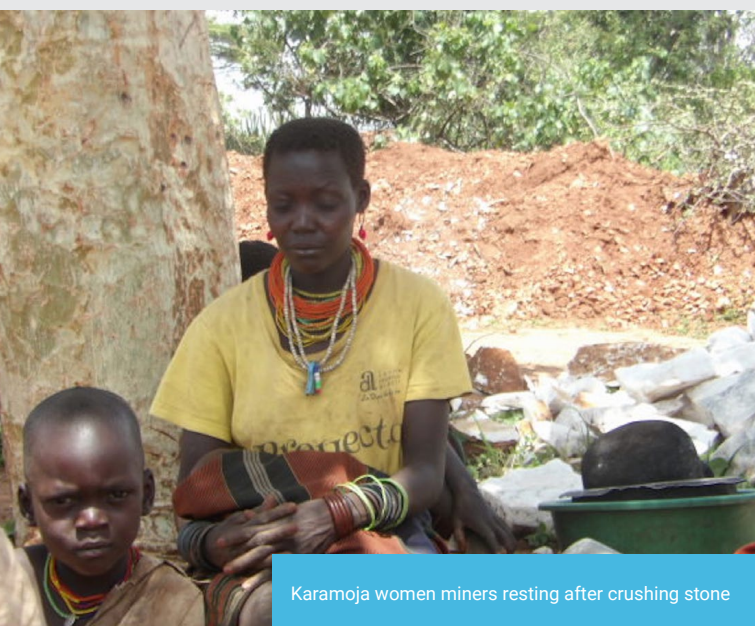
Karamoja women miners resting after crushing stone