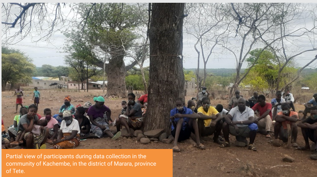
Partial view of participants during data collection in the community of Kachembe, in the district of Marara, province of Tete.