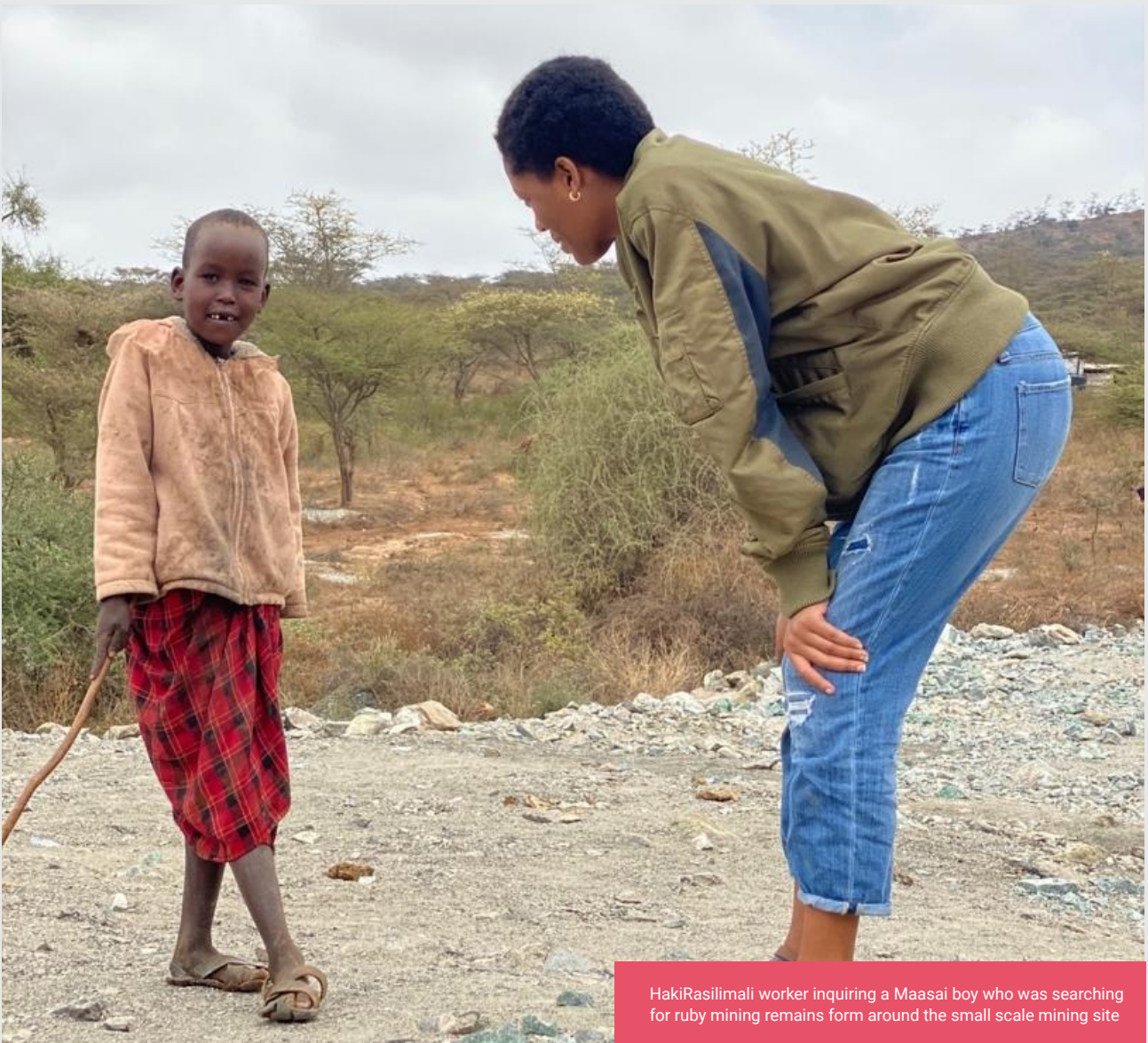
HakiRasilimali worker inquiring a Maasai boy who was searching for ruby mining remains form around the small scale mining site