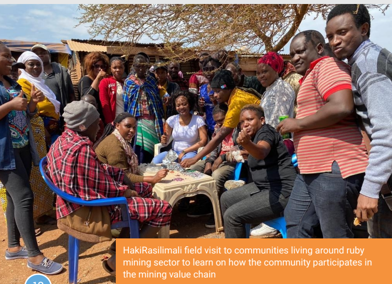
HakiRasilimali field visit to communities living around ruby mining sector to learn on how the community participates in the mining value chain

The annual budgeting process for villages/wards/districts requires participation from community members at each level. Villagers, with support from district and ward facilitators, suggest and prioritise community development projects. This at least provides a precedent for budgeting and project input from local community members, including women. However, the Local Government District Authorities Act fails to require women's membership on Village Councils, District Councils, or Township Authorities.