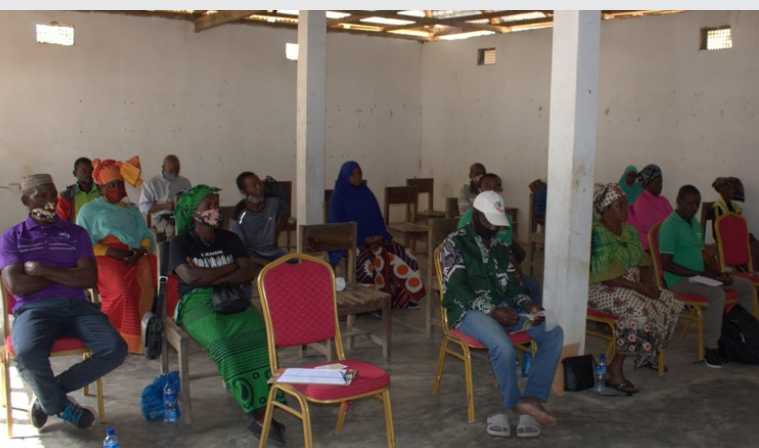
Partial View of the participants during the validation of the study results with communities in the district of Larde, Nampula province.

Finally, while Mozambique's Constitution provides that women and men are equal before the law (art. 36), and that the state "promotes, supports and values the development of women and encourages their growing role in society, in all spheres of the country's political, economic, social and cultural activity" (art. 122), the state also recognises "legal pluralism" and customary systems and rules, to the extent that they are not contrary to the fundamental principles and values of the Constitution (art. 4) (RoM, 2004, 2018). Overall, most laws are "neither applicable nor favourable to women," and also "sexual discrimination, gender violence, traditions and perceptions, ignorance of the laws, and the culture...perpetuates the inferiorization of women" (KUWUKAJDA, 2021).