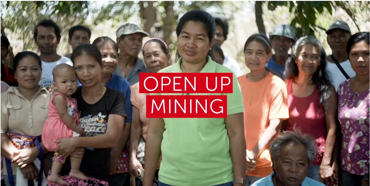
Still from BK-PWYP film Open Up Mining (2019), produced by the donor, HIVOS. To view the film please click on the image